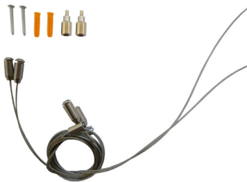
Hanging kit / Záves