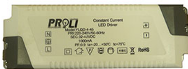
Proli 1000mA (32-40V)