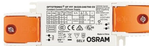
Osram OT FIT 40 1A0 CS