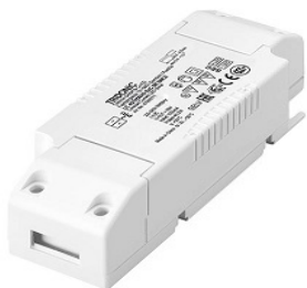
Tridonic LC 1050mA fixC SR SNC2